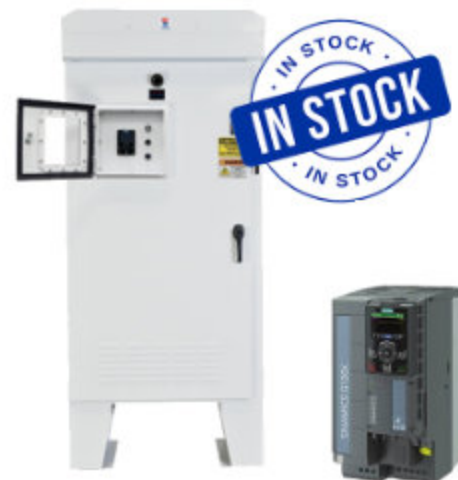
Powered by the Siemens G120X Variable Frequency Drive

Engineered for demanding environments, the WCD Series Premium Package Panel delivers energy savings, advanced motor control, and robust protection all in a NEMA3R- rated , heavy-duty enclosure. Factory-stock units range from 60 to 300HP(VT) .