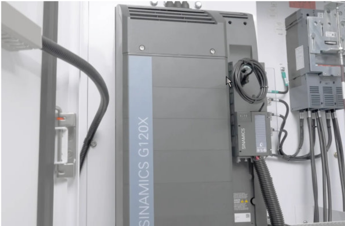
Powered by the Siemens G120X Variable Frequency Drive