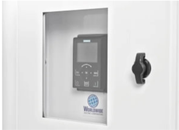
Secure Door Mounted Keypad

The Vortex cooling tunnel enhances airflow for maximum heat dissipation, ensuring stable performance and extended equipment life in the most harsh conditions.